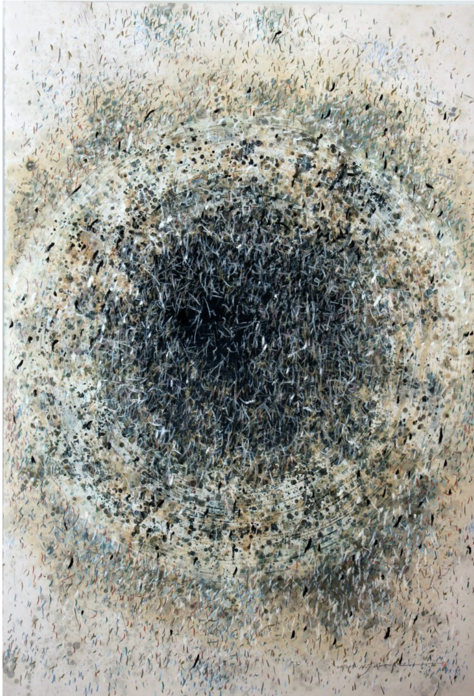
Kwang Jean Park. "2013.04," 2013. Mixed media on paper, 44 x 30 inches.

A closer examination of the work reveals an architecture beneath the layers; for example, the woodblock derived rings beneath a series of paintings that resemble,